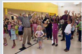
Homespun Community Dancing